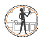
Clean shared surfaces