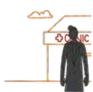
Call the clinic if you're sick