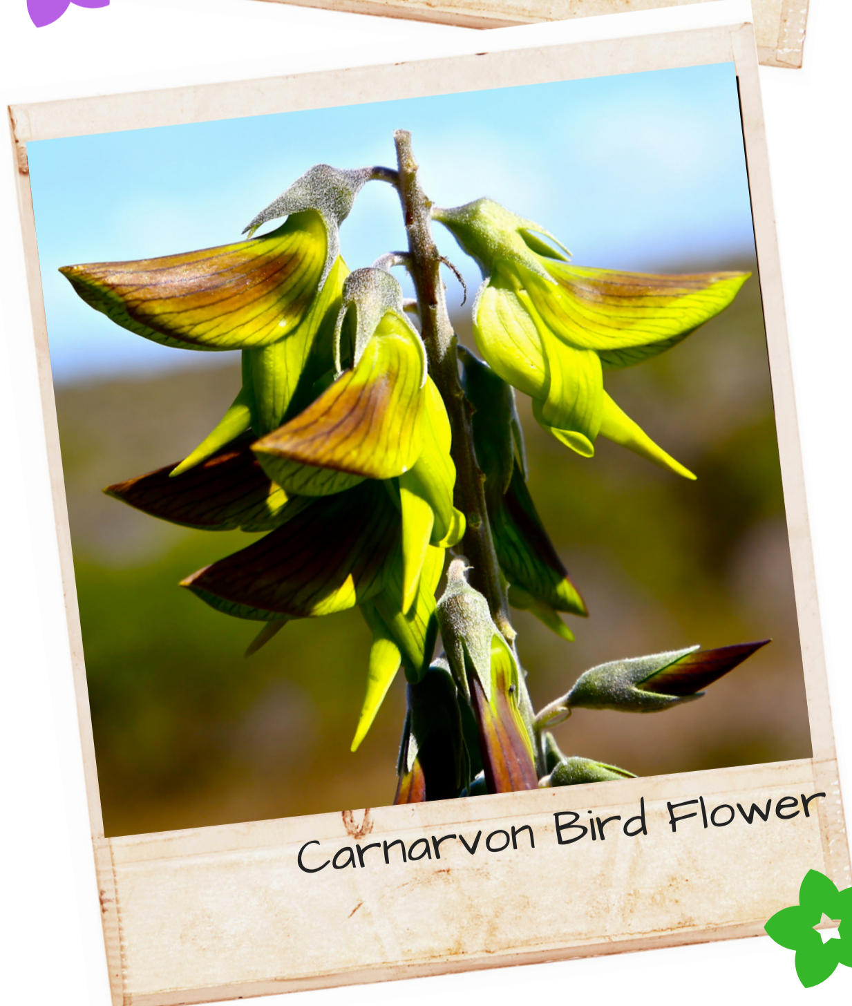
Carnarvon Bird Flower