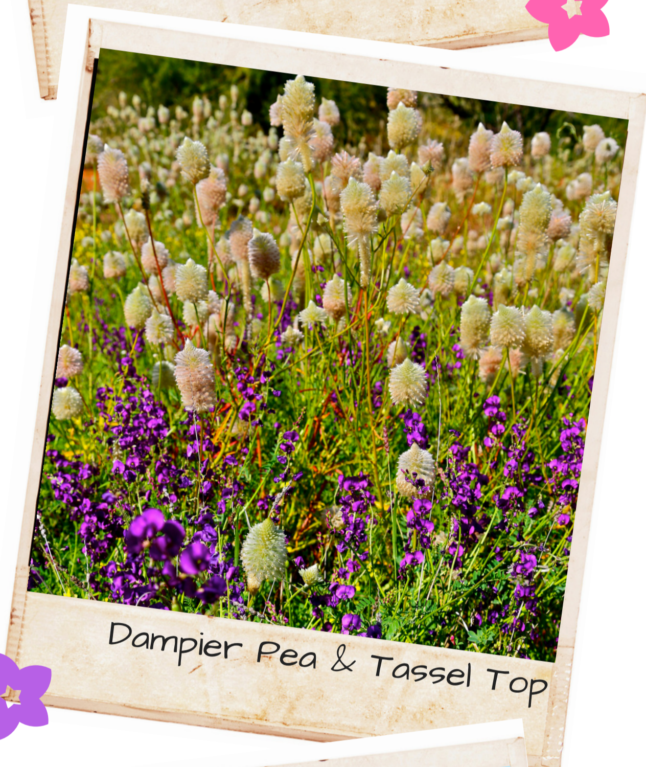
Dampier Pea & Tassel Top