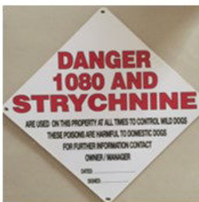
DANGER – 1080 and Strychnine Signs