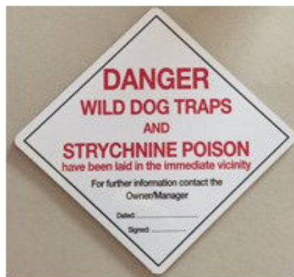
DANGER - Wild Dog Trap Signs

The SUG have a limited number of signs available for free and a limited amount of Templates available for Loan only.