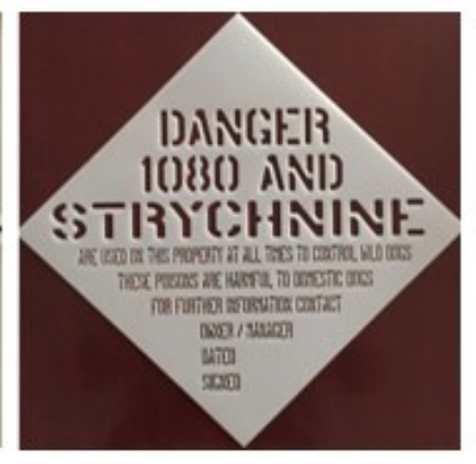
DANGER - 1080 and Strychnine Template