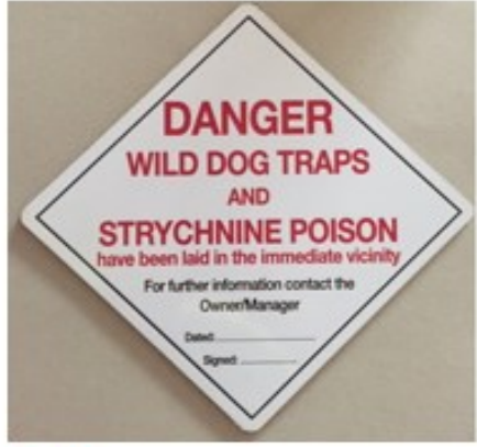
DANGER - Wild Dog Trap Signs

The SUG have a limited number of signs available for free and a limited amount of Templates available for Loan only.