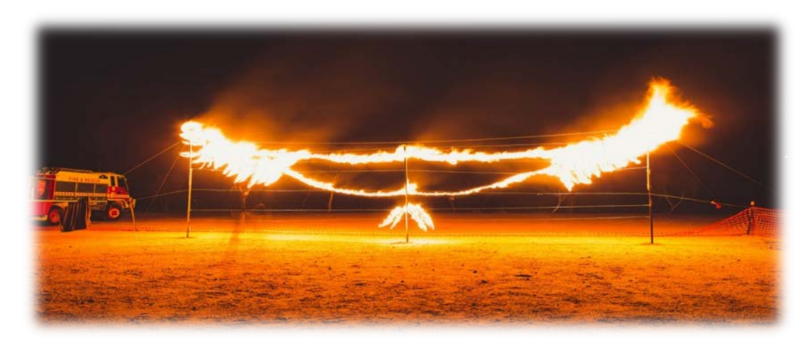
(figure 3 – Gascoyne in May Music Festival)

The Shire appreciates the support of the community as we all strive to achieve the best possible, financially sustainable, result for residents in the Shire of Upper Gascoyne.