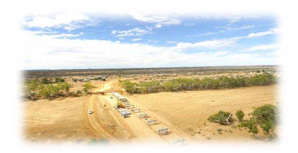
(figure 1 Killili Bridge under construction)

The bridge over the Gascoyne River was completed in December 2016.