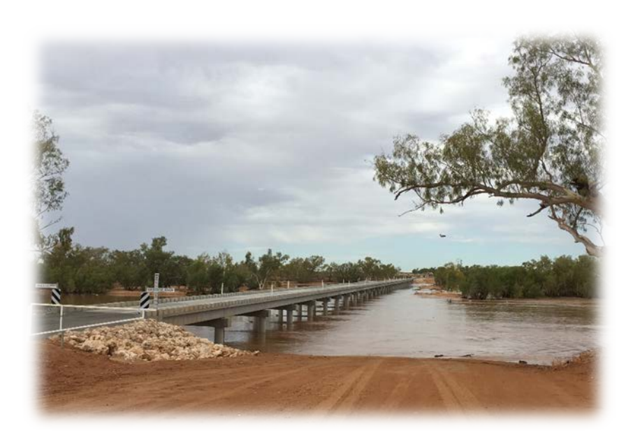
(figure 2 – Killili Bridge Completed)